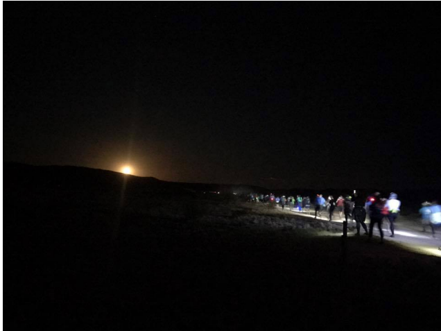
Joshua Tree Half Marathon Run

☞ ... will be the title of the new Zack Tolliver, FBI novel.